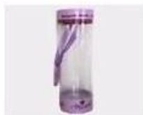
M. Pvc Box