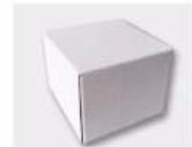
J. White Box