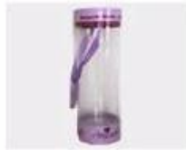
M. Pvc Box