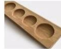
R. Wooden Pallet