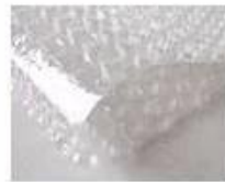
C. Bubble paper