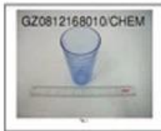
SGS Reference No.: 10000000000000000000 17 Oct 2014