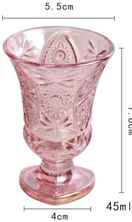
Pink love goblets