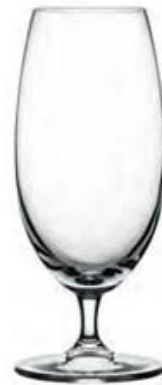
15 OZ H : 16.5cm B : 6.8cm