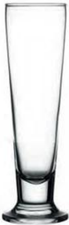
13.5 OZ H : 23.7cm T : 6.8cm B : 7.4cm