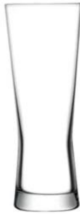
19 OZ H : 21.2cm T : 8.2cm B : 7cm