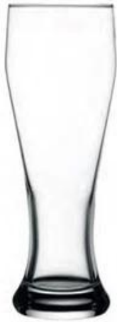
22.2 OZ H : 23.3cm T : 8cm B : 7.6cm