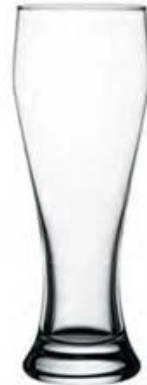
13.7 OZ H : 19.9cm T : 7.4cm B : 6.5cm