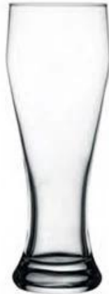
17.2 OZ H : 21.7cm T : 7.5cm B : 7.1cm