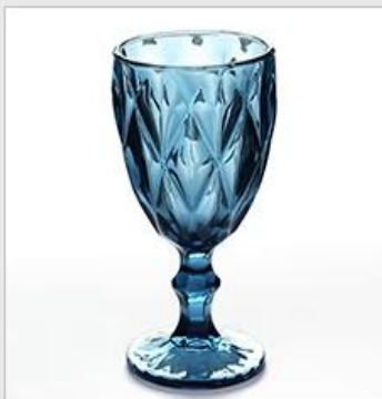
Diamond - blue