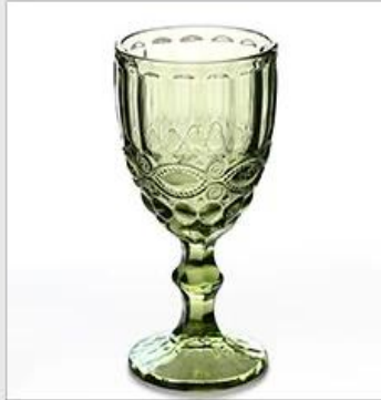
pattern - green