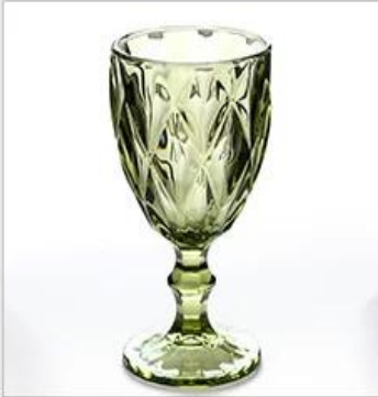
Diamond - green