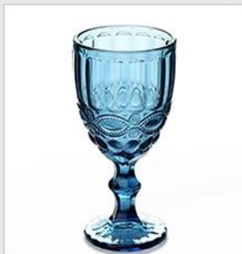
Pattern - blue