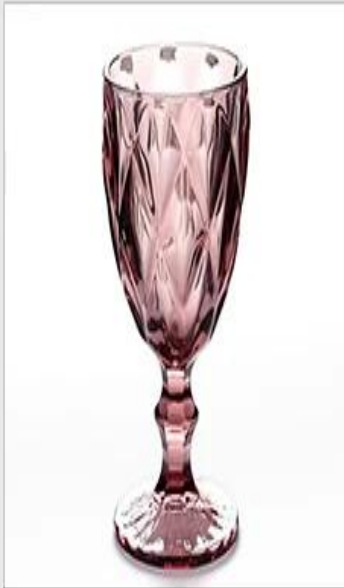
Diamond - red