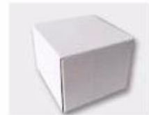
J. White Box