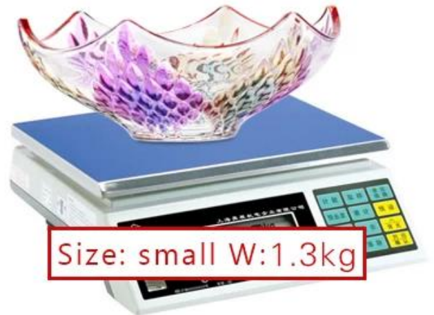
Size: small W:1.3kg