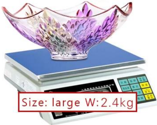
Size: large W:2.4kg