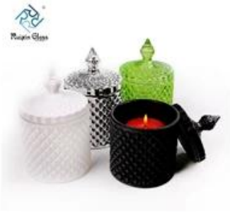
Colored Candle Jar With Lid