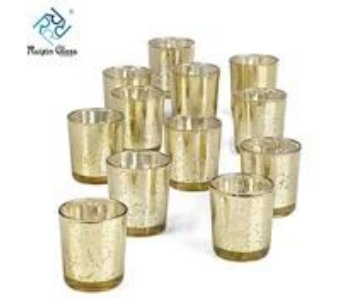
Factory Price Candle Holder 12pcs