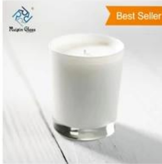
Candle Holder Wedding