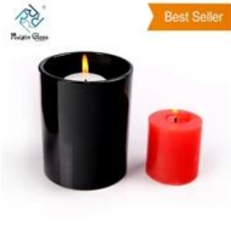
Black candle holders wholesale