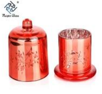
Glass Candle Holders Cheap