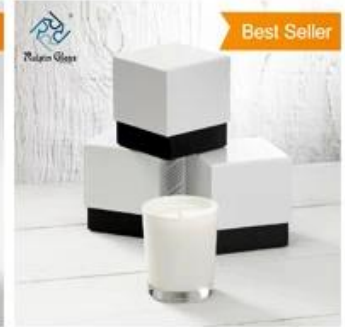
Cheap Crystal Candle Holder