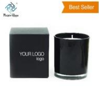
Custom Design Candle Holder