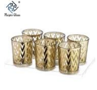
6pcs Votive Candle Holders Wedding