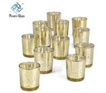
Factory Price Candle Holder 12pcs