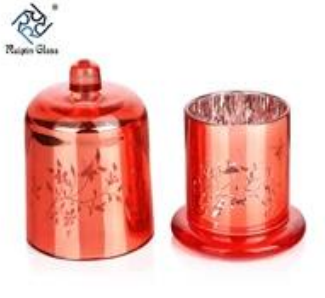
Glass Candle Holders Cheap