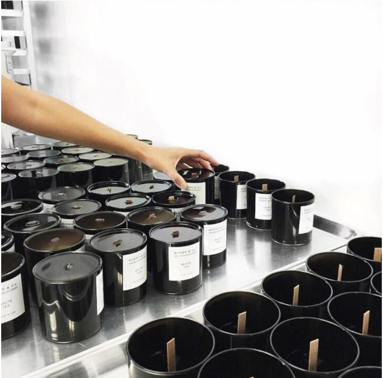
2. DIY photo