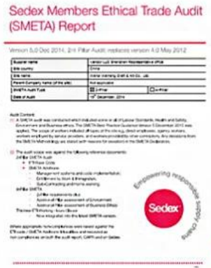
Sedex Verify factory certificate