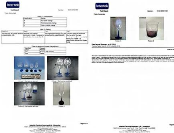
Spray glass cup dishwasher test report