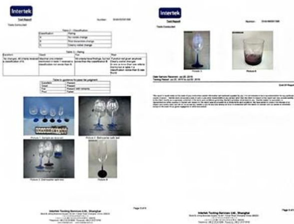
Spray glass cup dishwasher test report