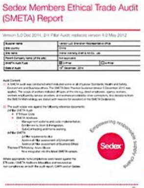
Sedex Verify factory certificate