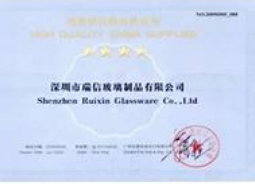
Quality Supplier Membership Certificate