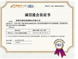
Alibaba TrustPass Membership Certificate