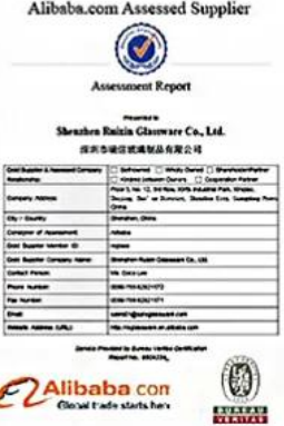
BV Verify factory