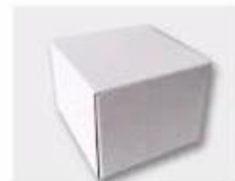
J. White Box