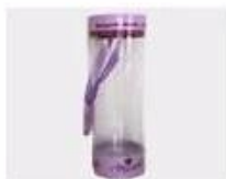
M. Pvc Box