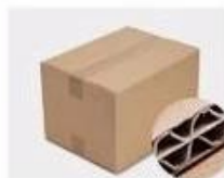
G. Five layer Corrugated paper master carton