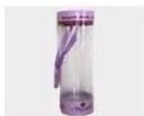
M. Pvc Box