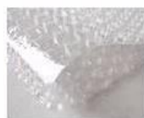
C. Bubble paper