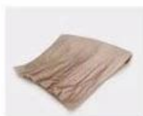
B. Corrugated paper