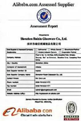
BV Verify factory