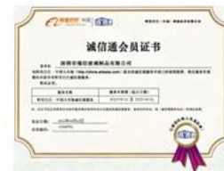
Alibaba TrustPass Membership Certificate