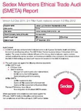
Sedex Verify factory certificate