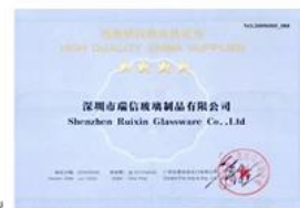
Quality Supplier Membership Certificate