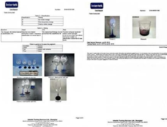
Spray glass cup dishwasher test report