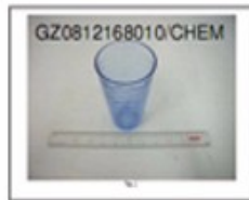
Reference to photo original only 只供参考