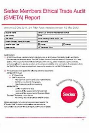
Sedex Verify factory certificate