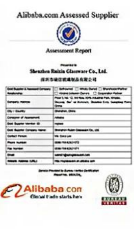
BV Verify factory