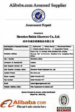
BV Verify factory