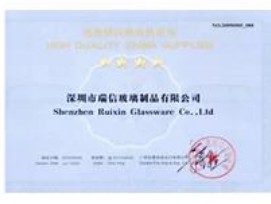
Quality Supplier Membership Certificate