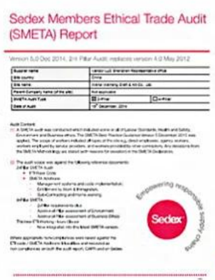
Sedex Verify factory certificate