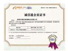
Alibaba TrustPass Membership Certificate