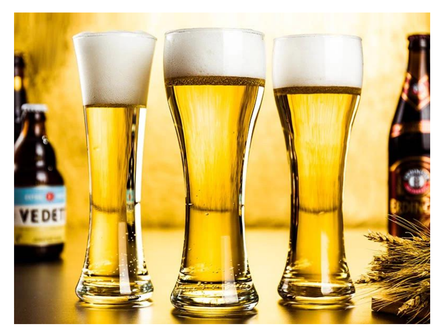
What are the functions of beer glass cup?

1)Machine blasted /pressed, elegant pattern, widely use in restaurant/hotel/home/party etc.