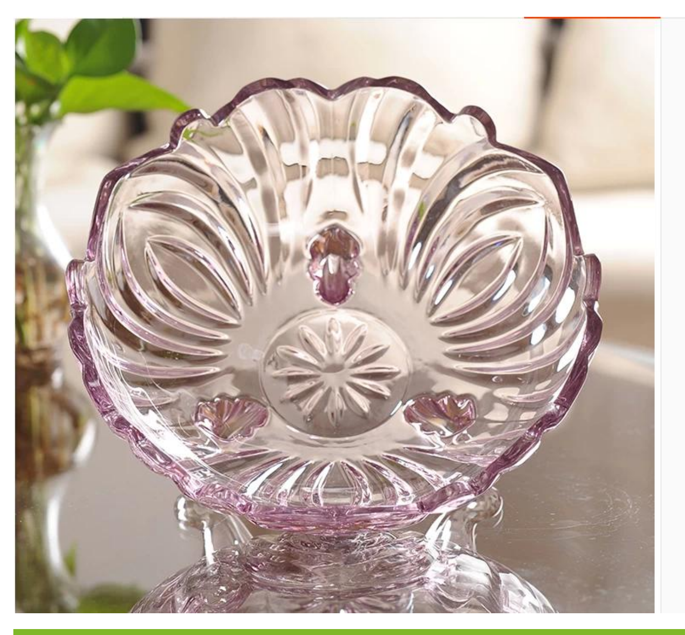
What are the fruit bowl ashtray applications?