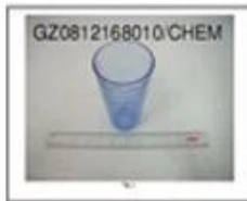
SGS Reference for this report: 1604242014 17 Oct 2014