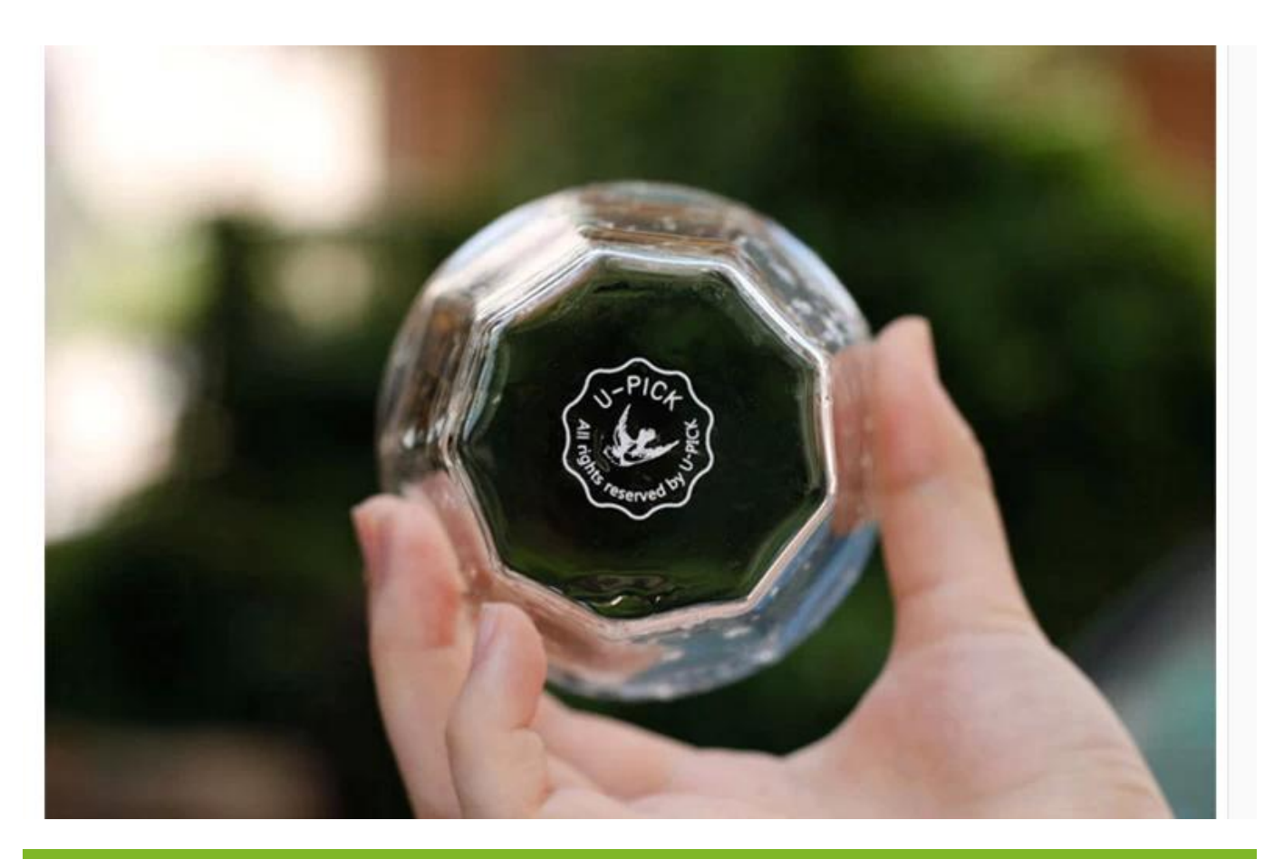
What are the small drink glasses applications?