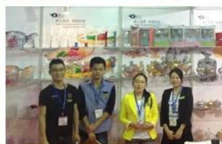
Our sales team: