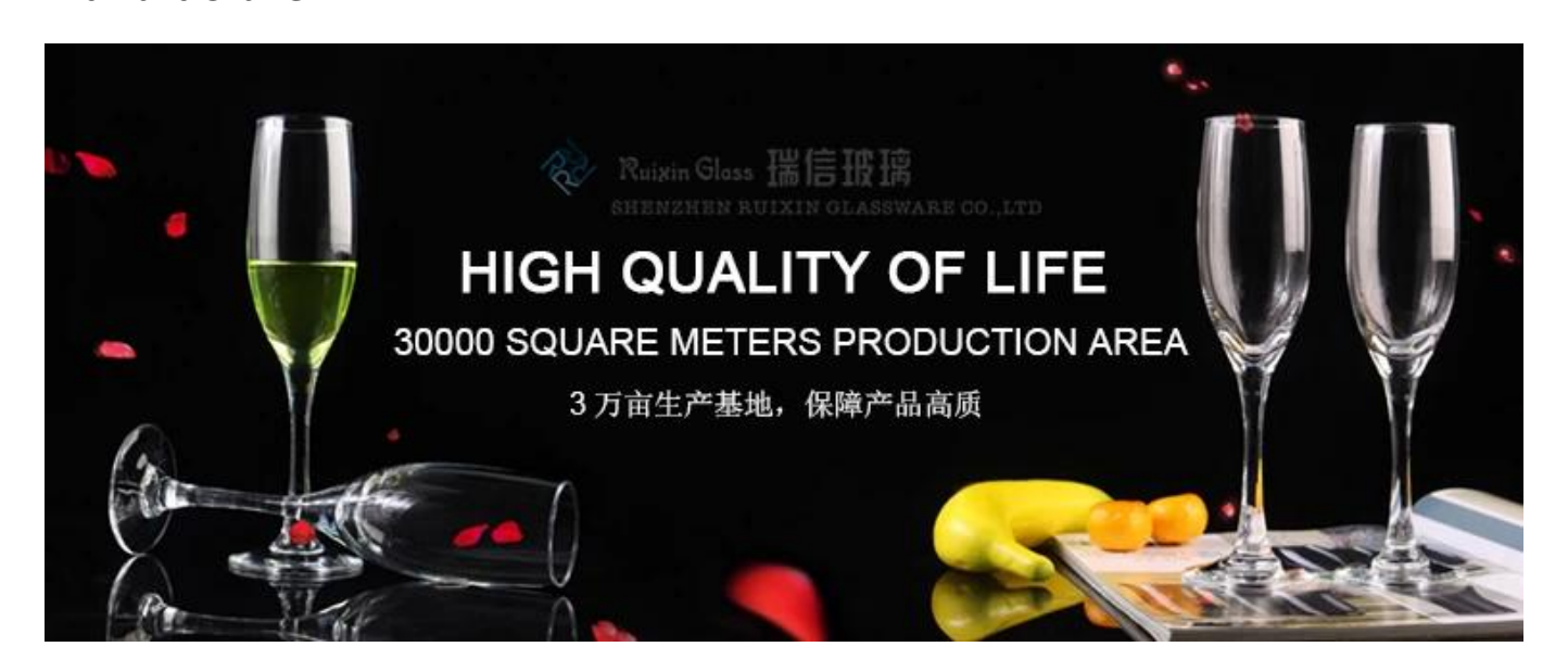
What are the features of pretty wine glasses?