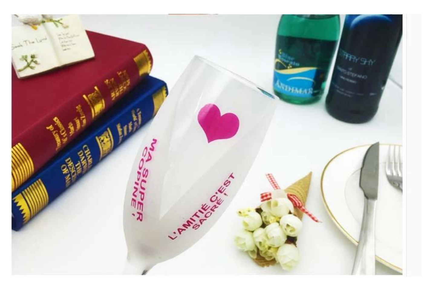
What are the pretty wine glasses applications?