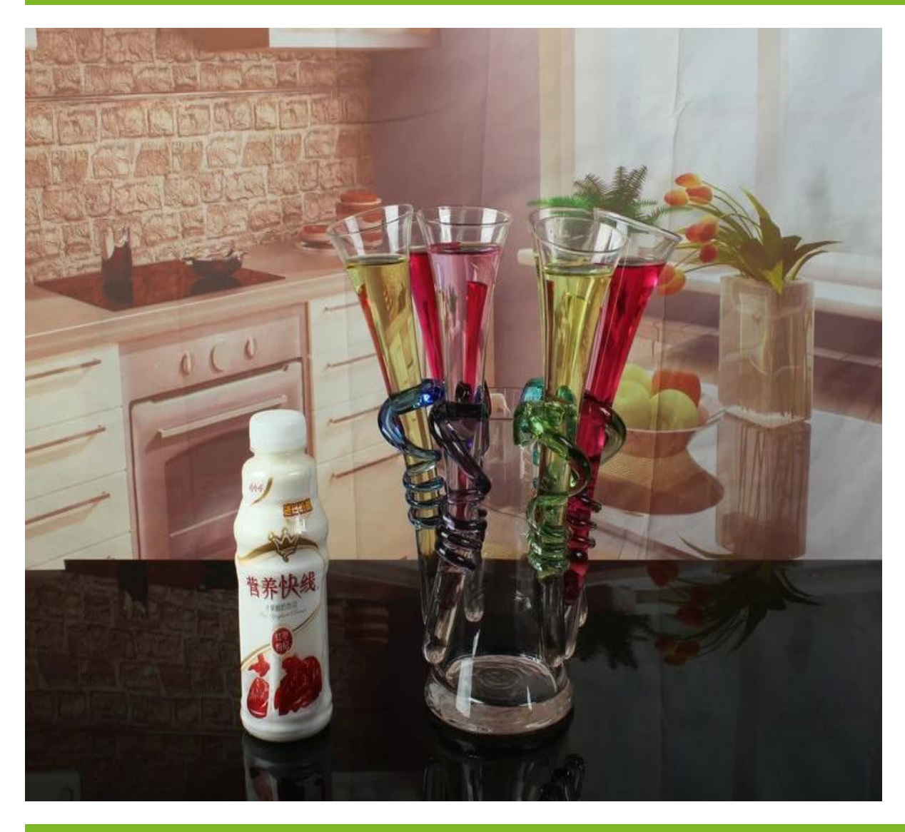
What are the functions of champagne cup?