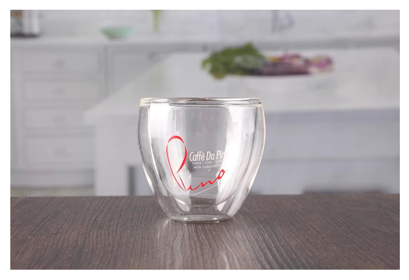
What are the functions of Hand blown Double Wall Glass Cups?

What are the features of Hand blown Double Wall Glass Cups?