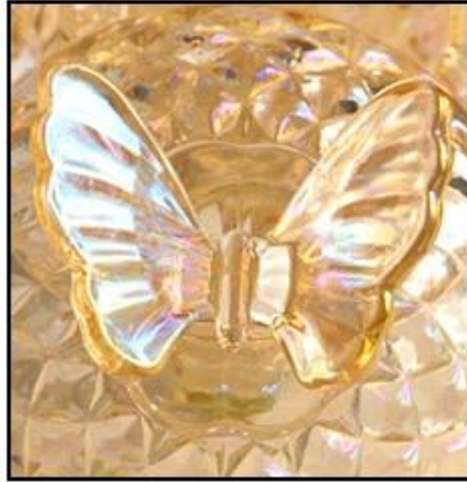
Papilionaceous Lid Design