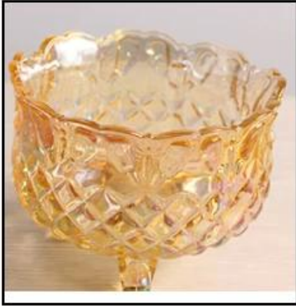
Floral Edge Design

The fruit are clear and transparent Fashion home art taste You deserve to have.