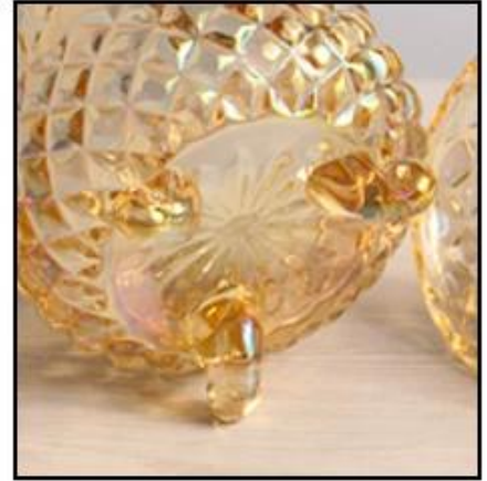
Trigonal Bottom Design