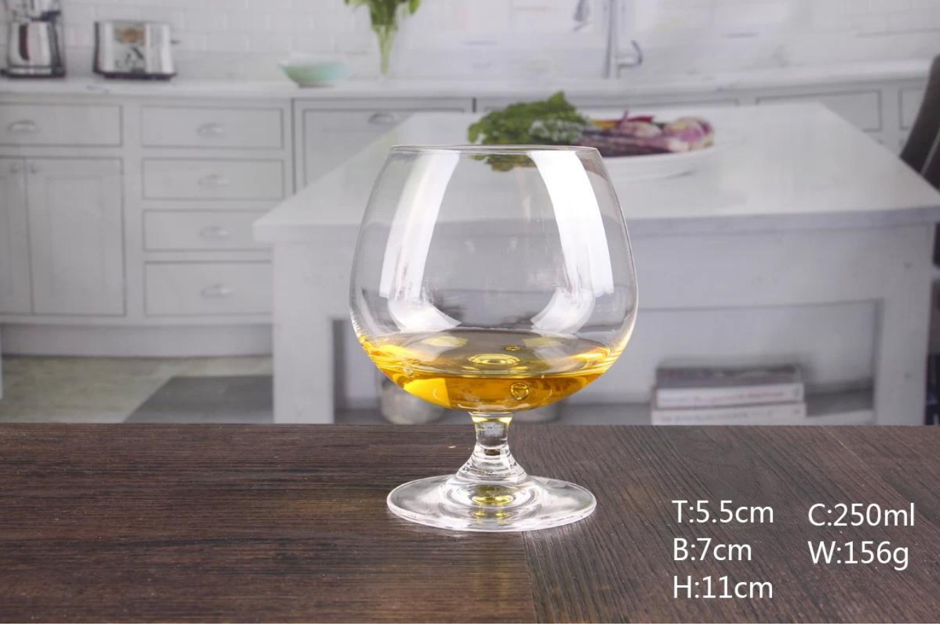
Lead free crystal cut brandy glasses wholesale