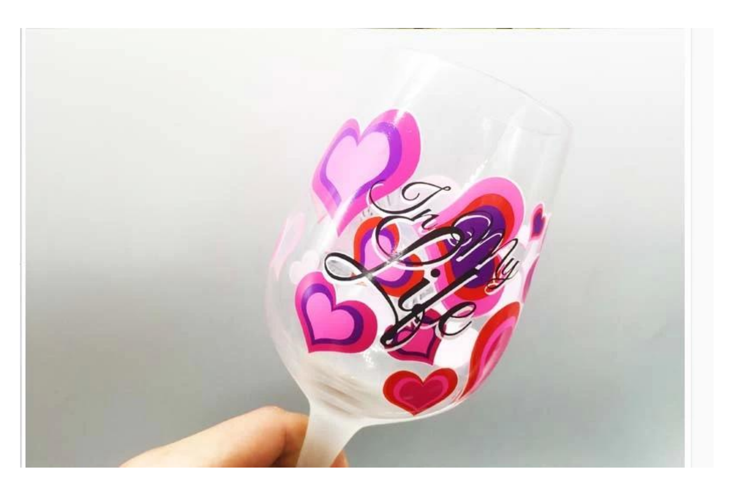
What are the holiday wine glasses applications?