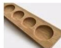
R. Wooden Pallet