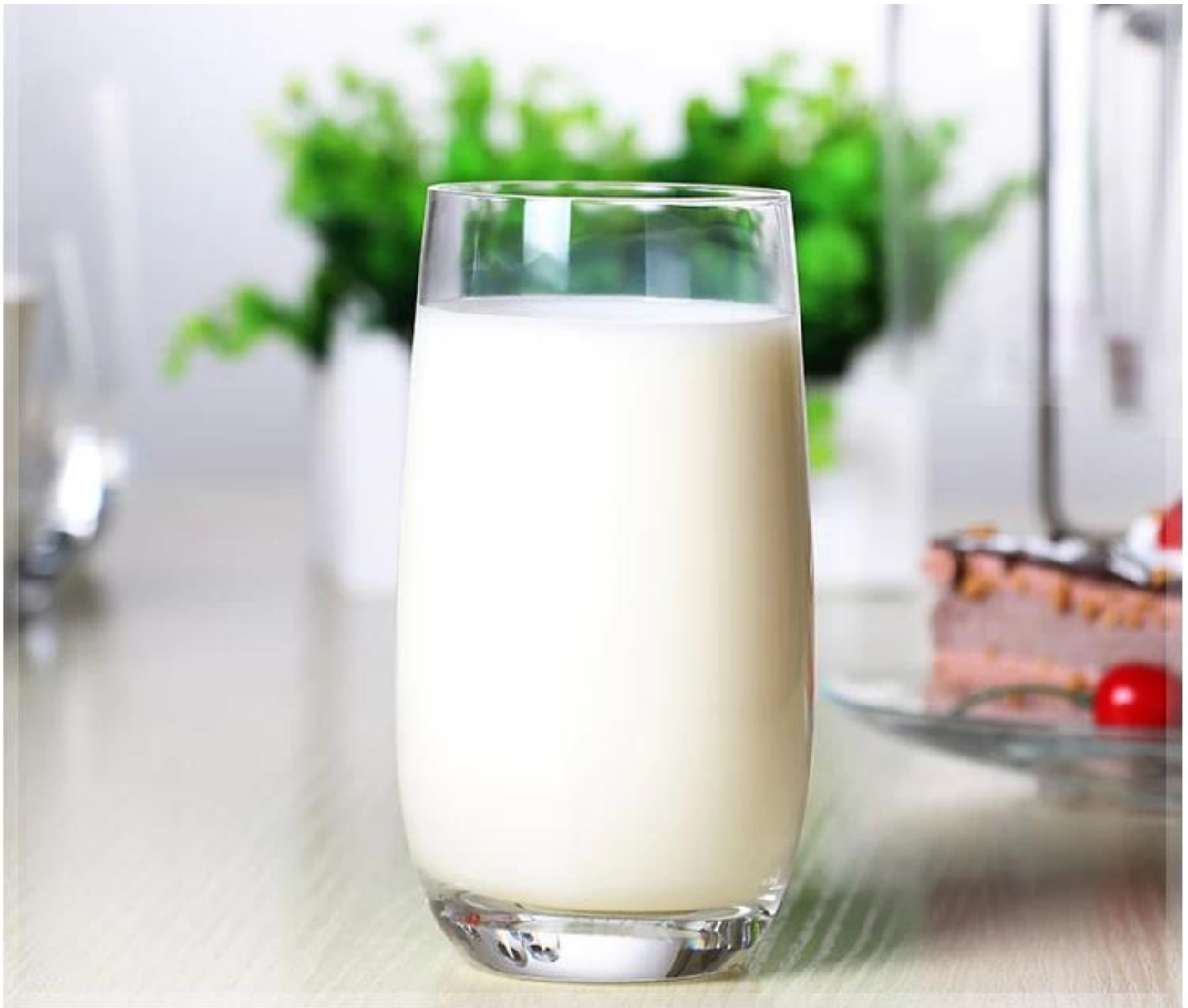
Sunny morning, a cup of milk for breakfast, enjoy the mother closed cup, happy life