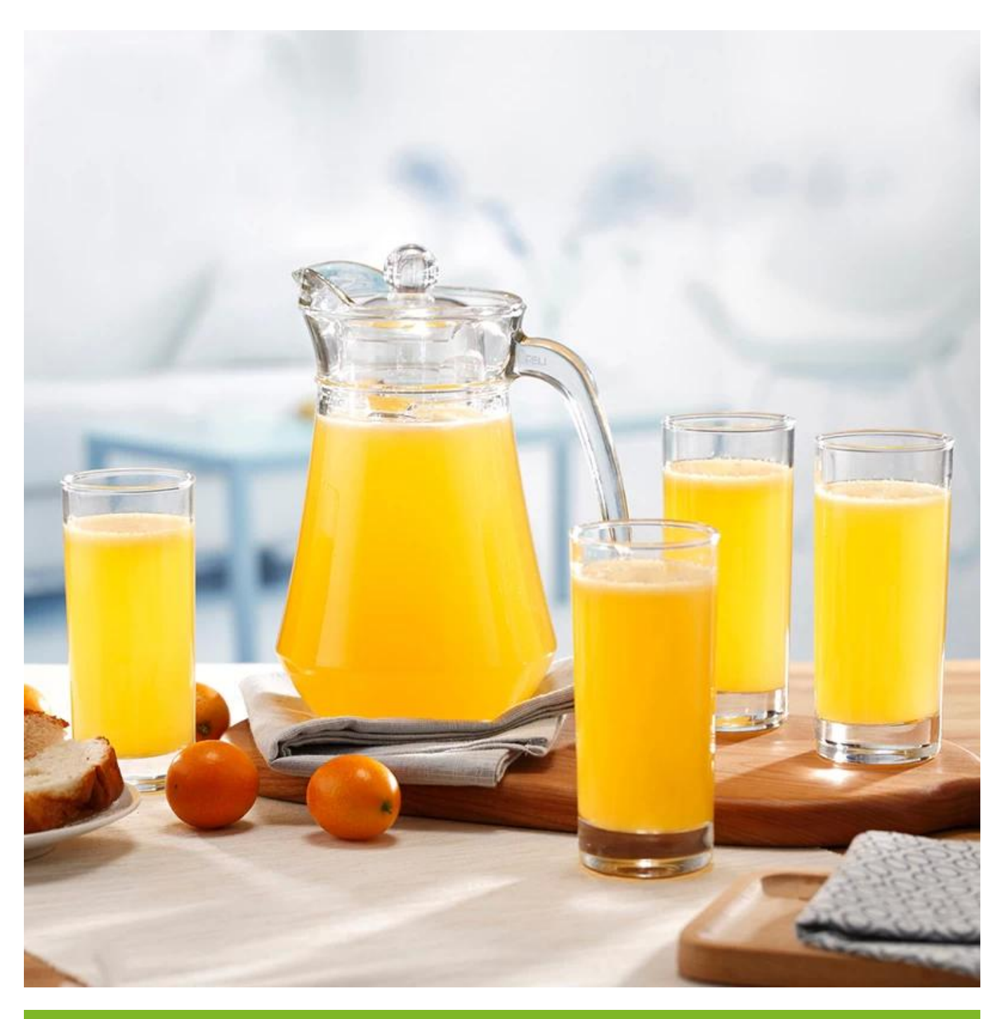
What are the glass bottle set applications?