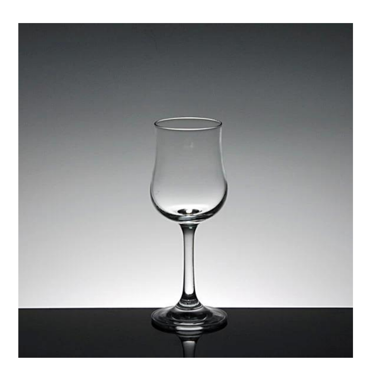
What are the martini glasses applications?