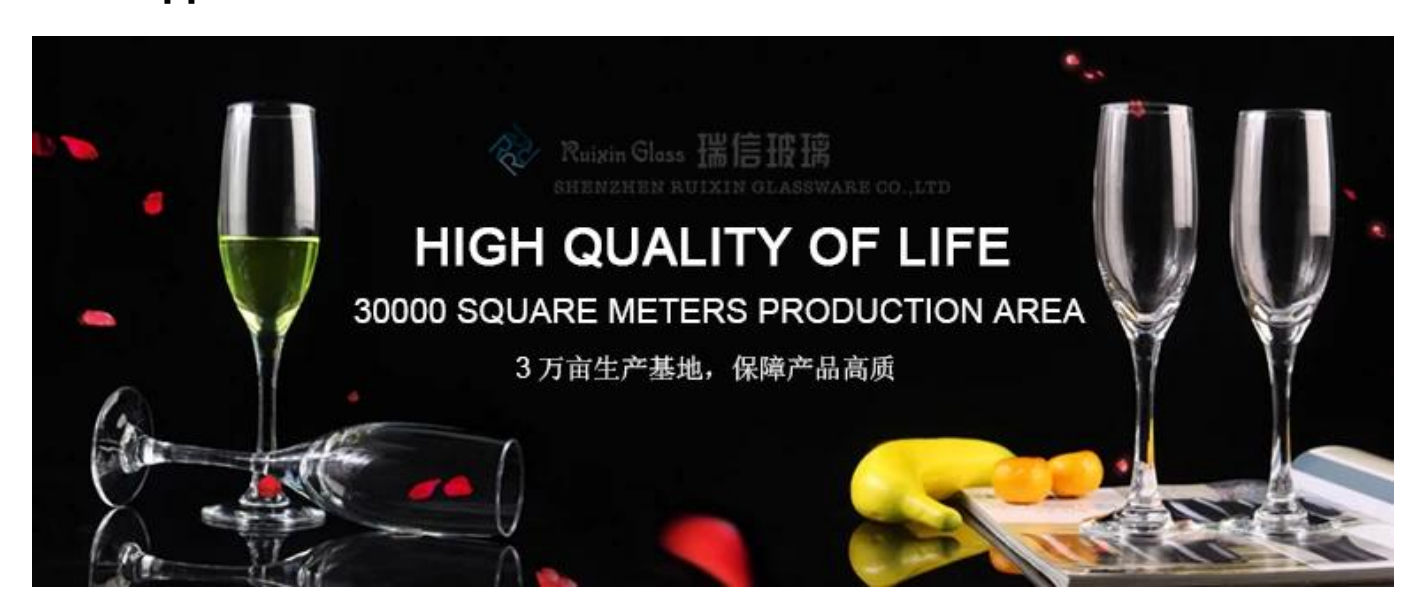
What are the features of martini glasses?