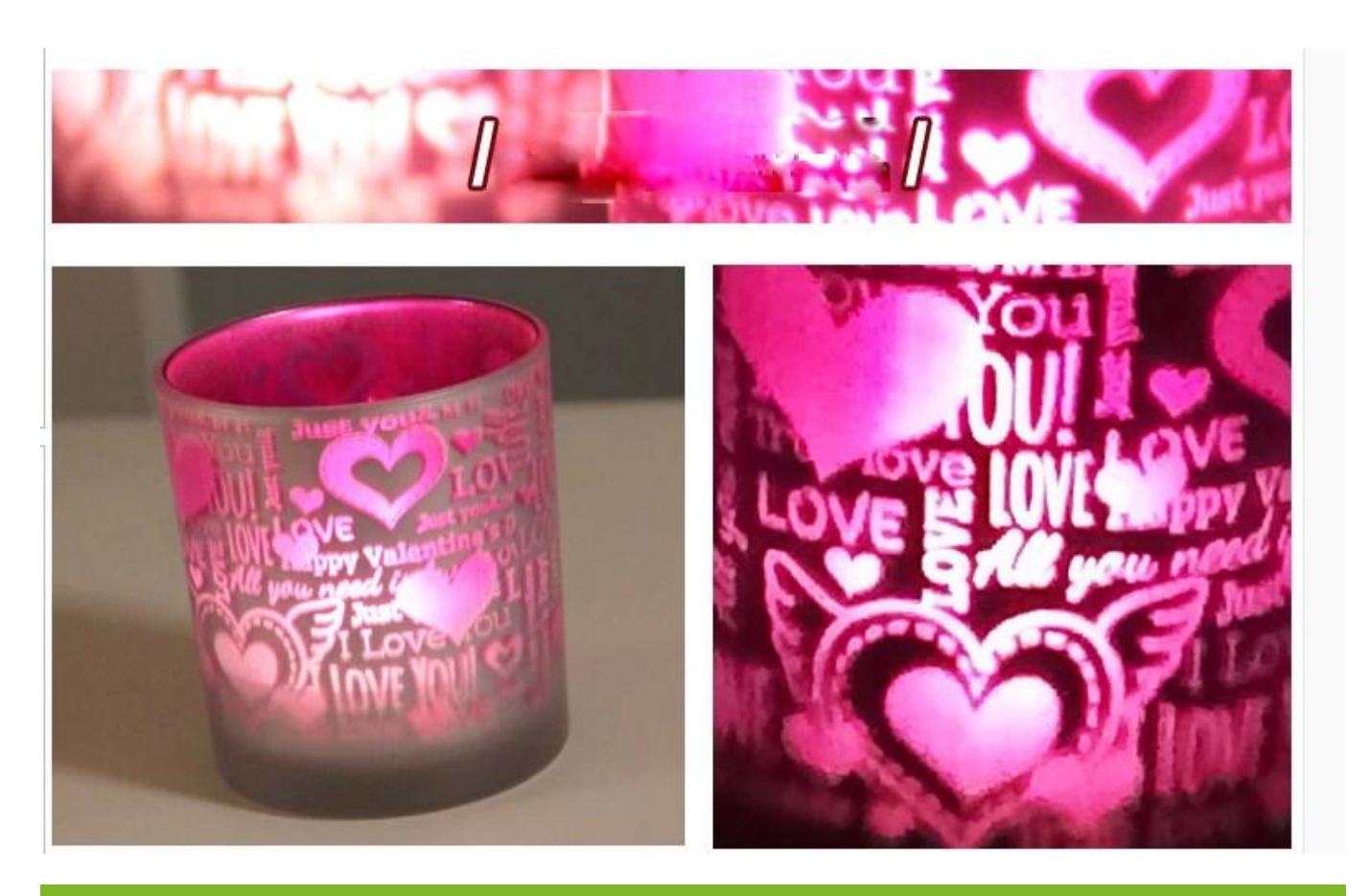
What are the votive candle holder applications?