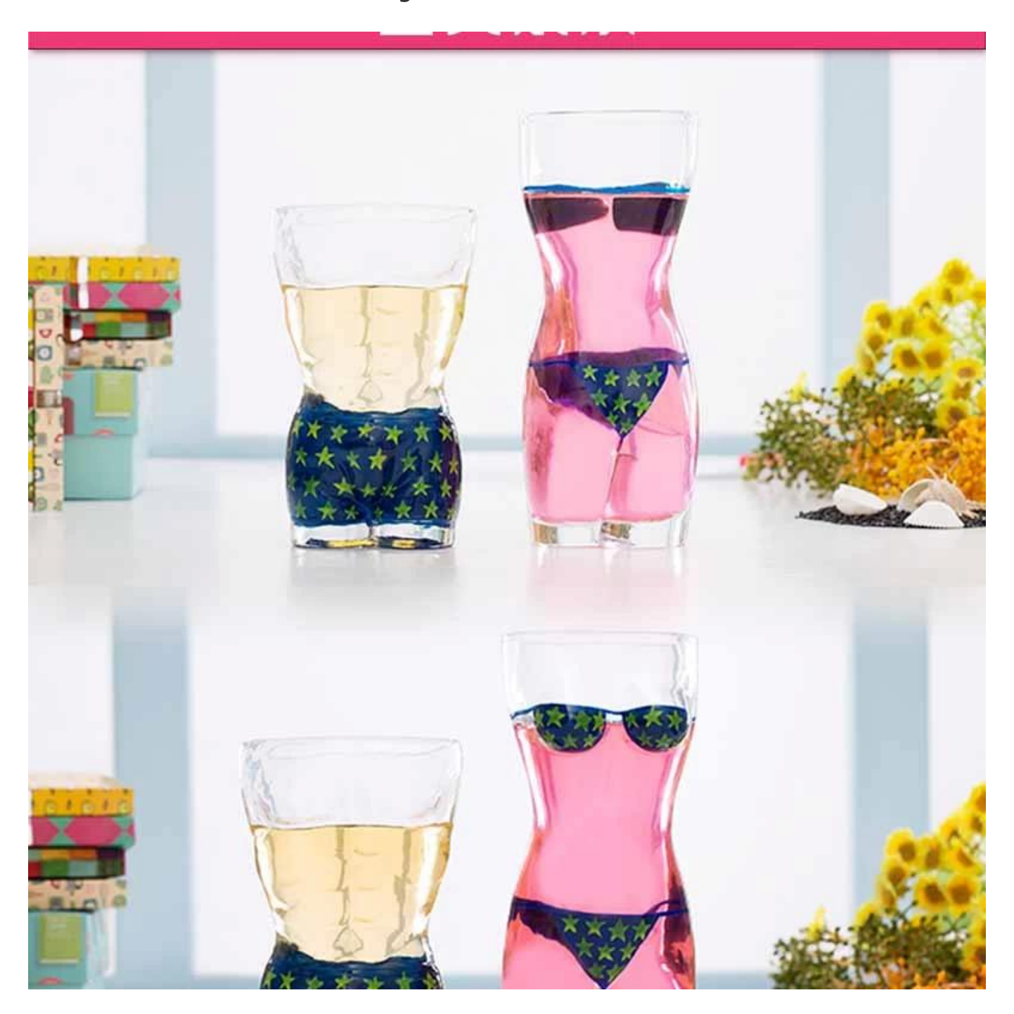
What are the functions of bar glasses?