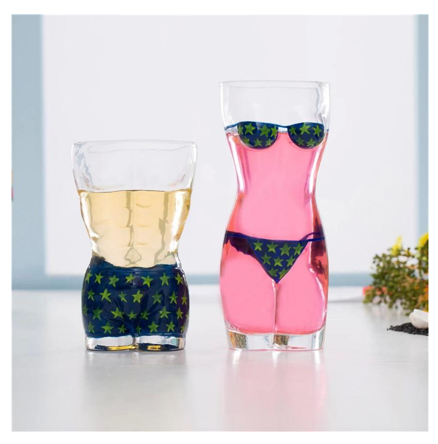
Who are we?