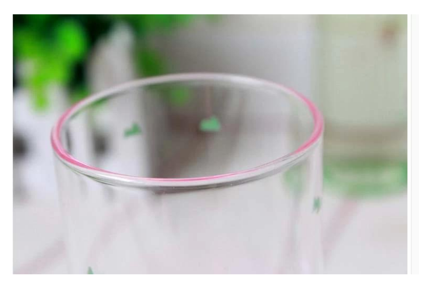
What are the colored drinking glasses applications?