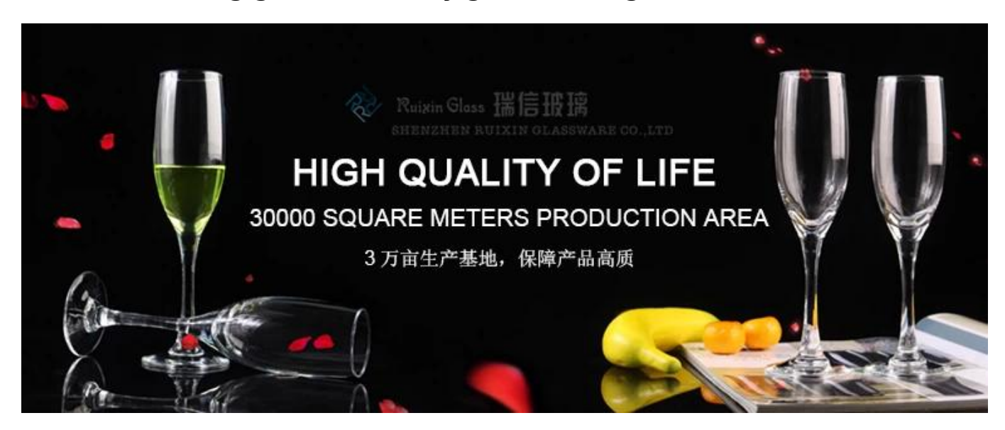
What are the features of colored drinking glasses?