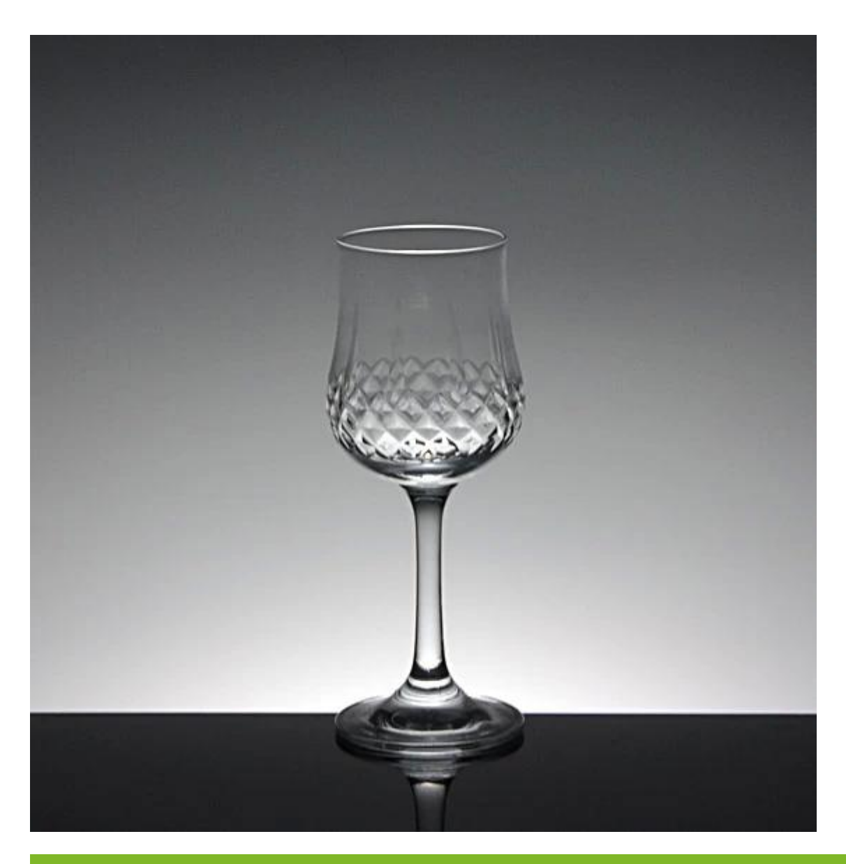
What are the crystal glass cup applications?