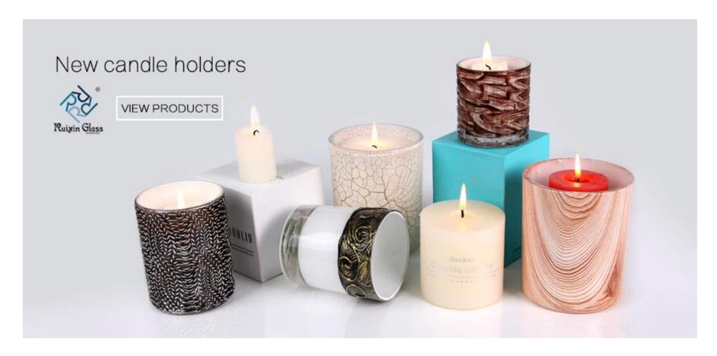
How to contact us?

A: L/C,T/T, Western Union, PAYPAL, or others according to your requirement.