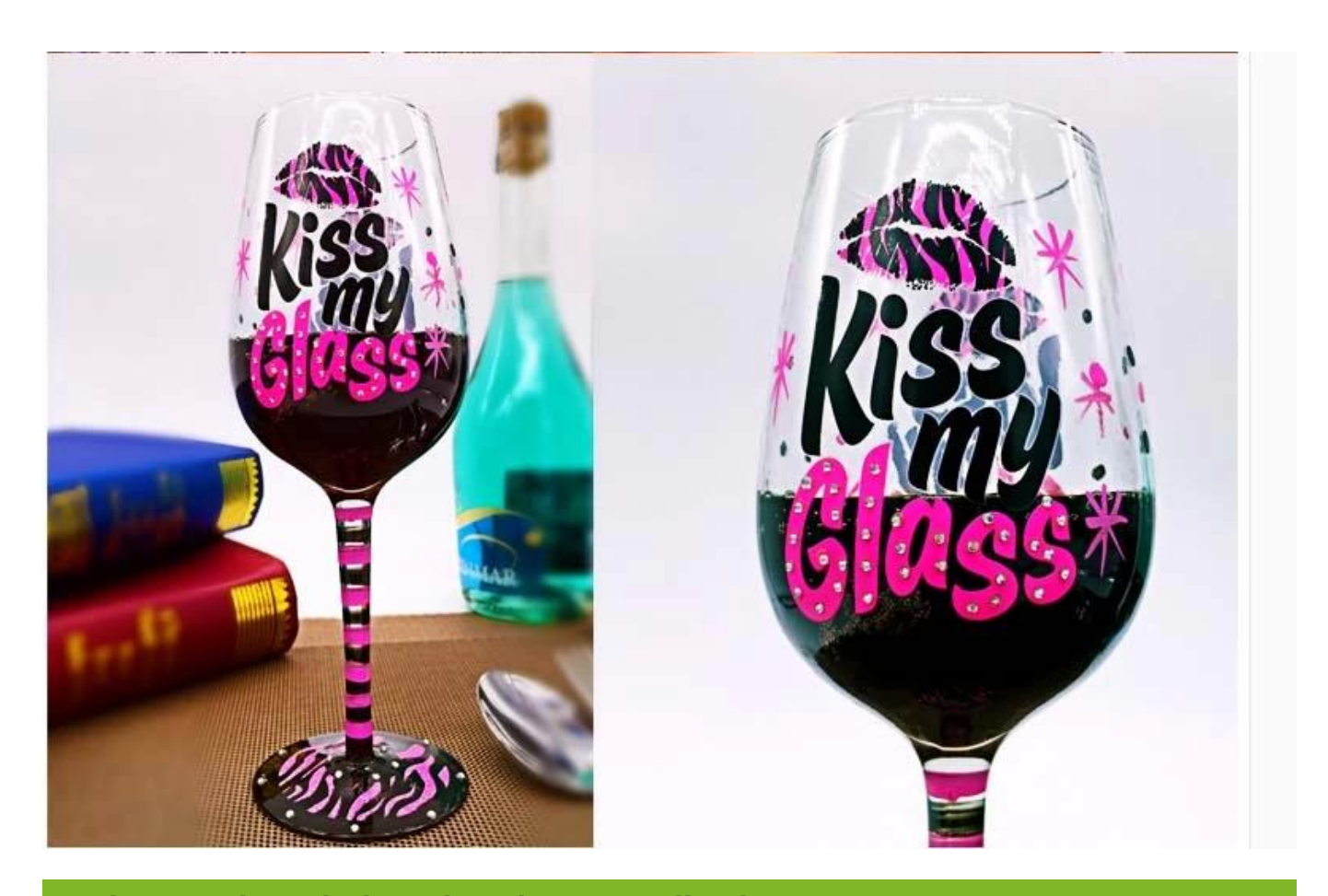
What are the painting wine glasses applications?