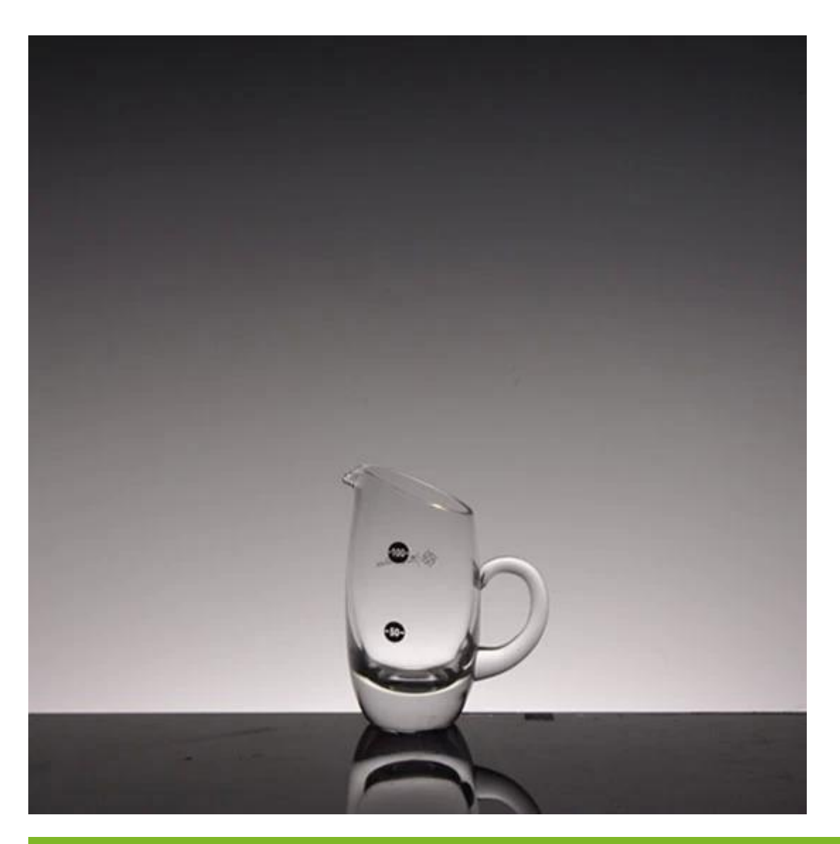
What are the glass decanter applications?