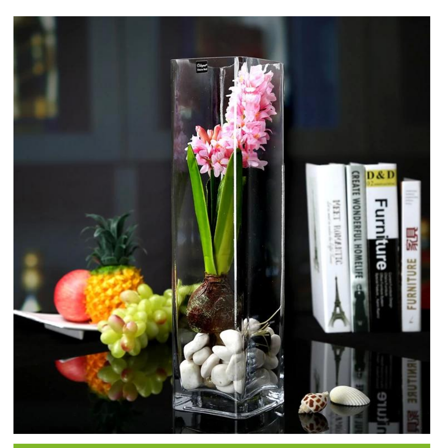
What are the decoration vases applications?