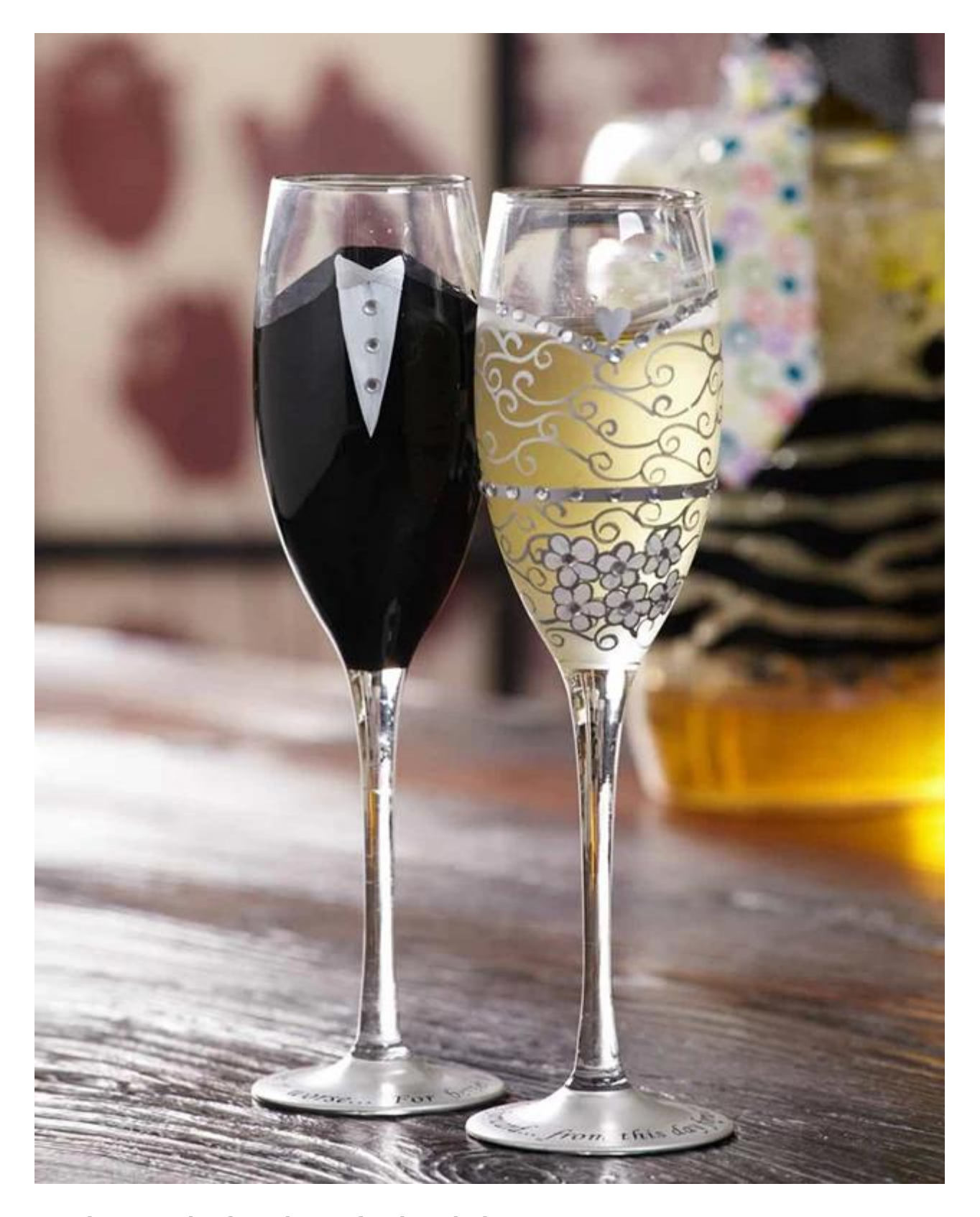
What are the functions of painted glass cups?