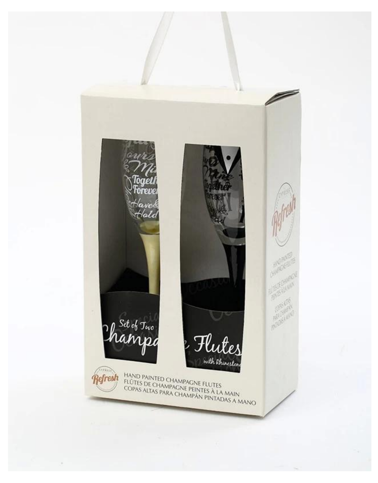
What are the painted glass cups applications?