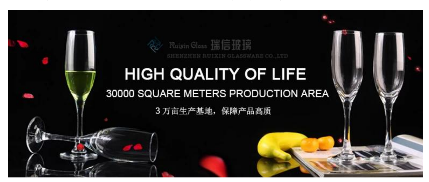
What are the features of glass container?