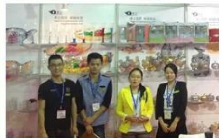
Our sales team: