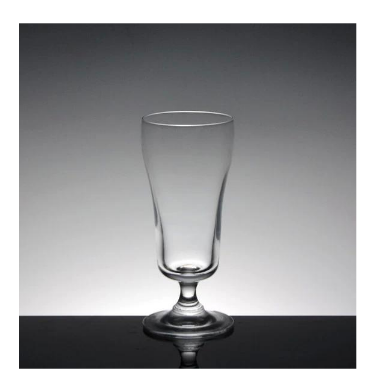
What are the champagne glass applications?