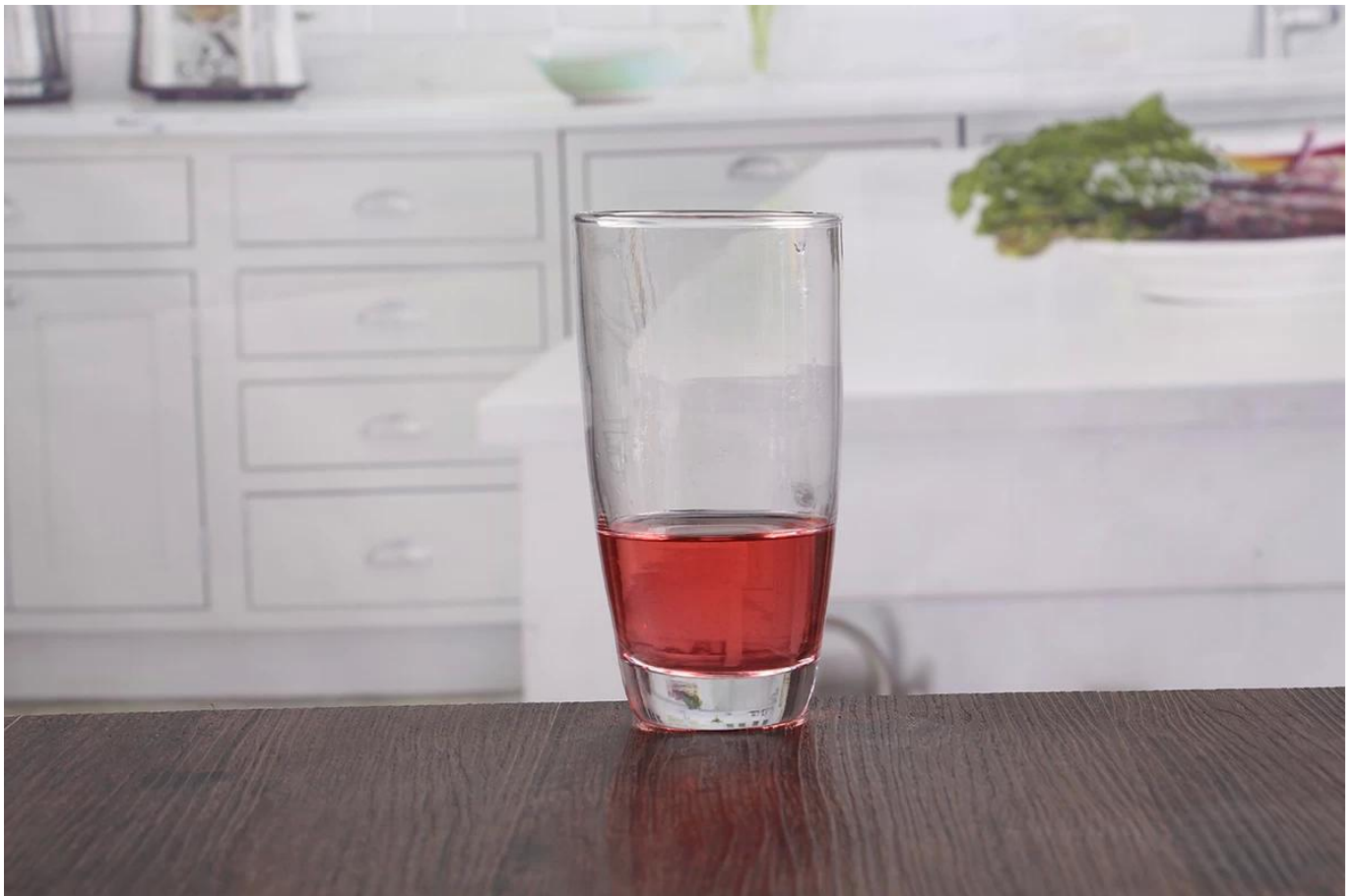
Drinking Glass Sets