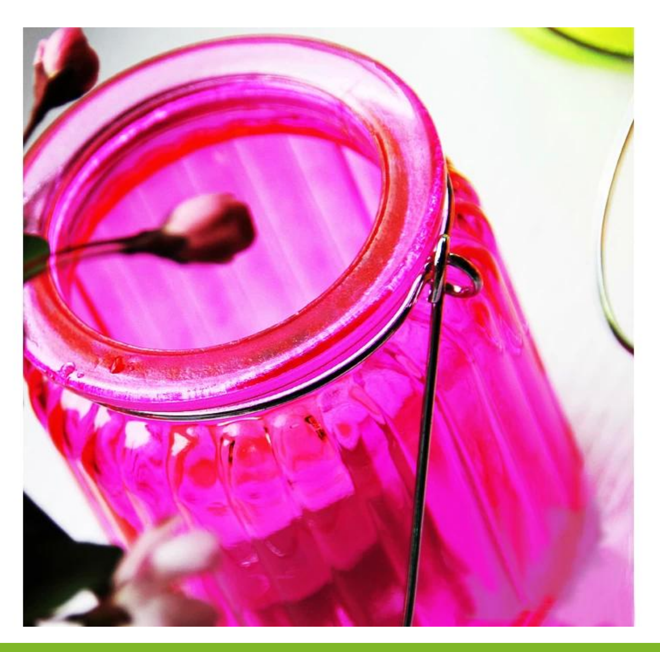
What are the wall mounted candle holders applications?