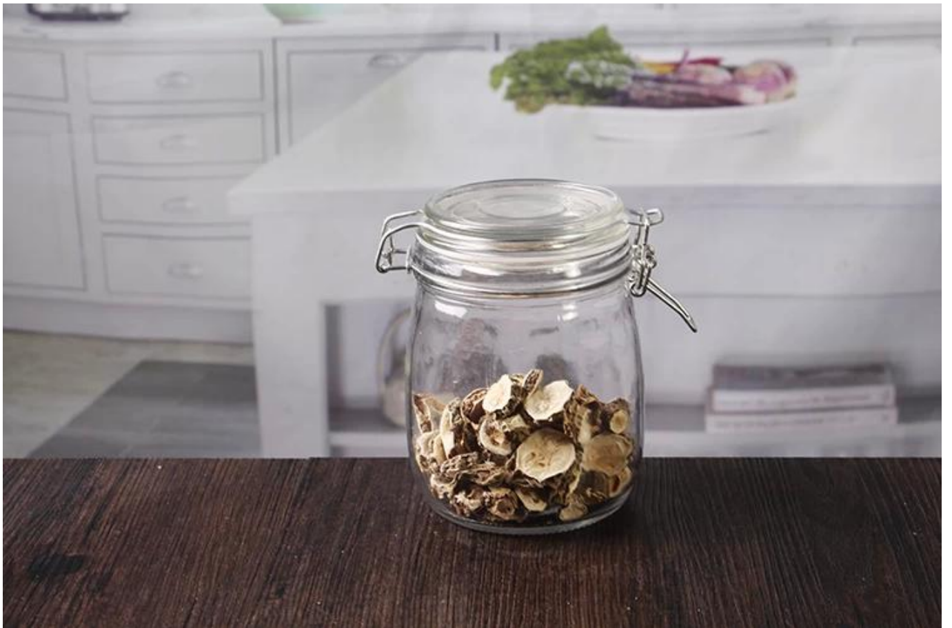
22 OZ Preserve Jars & cheap glass storage jars wholesale